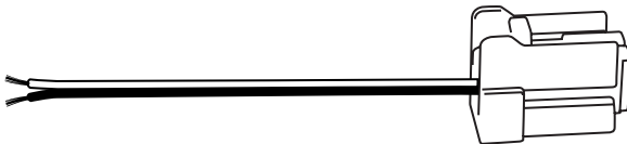
Fig 4 Speaker Extension Cable x2 (Male Plug)